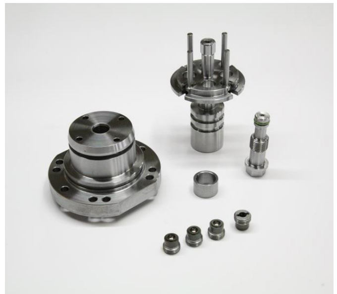
Figure 1: Alpha Lubricator MC upgrade

Please contact your Everllence PrimeServ office for more details.